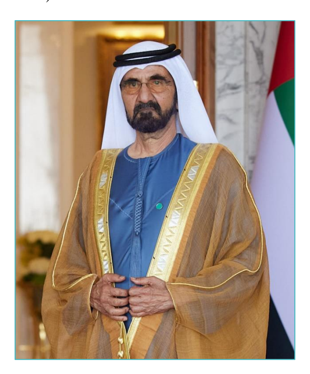
Figure 4: Shaykh Muhammad bin Rashid Al-Maktum, Prime Minister of the UAE

Furthermore, economic projects in the MENA region have been established based on these principles. For instance, the Gulf Cooperation Council (GCC) countries have launched various infrastructure projects aimed at promoting economic development regional integration. The Abdullah Economic City in Saudi Arabia (KAEC) and the Khalifa Industrial Zone in Abu Dhabi (KEZAD) are prime examples of initiatives focused on attracting foreign investment, fostering innovation, creating job opportunities (World Bank, 2022).