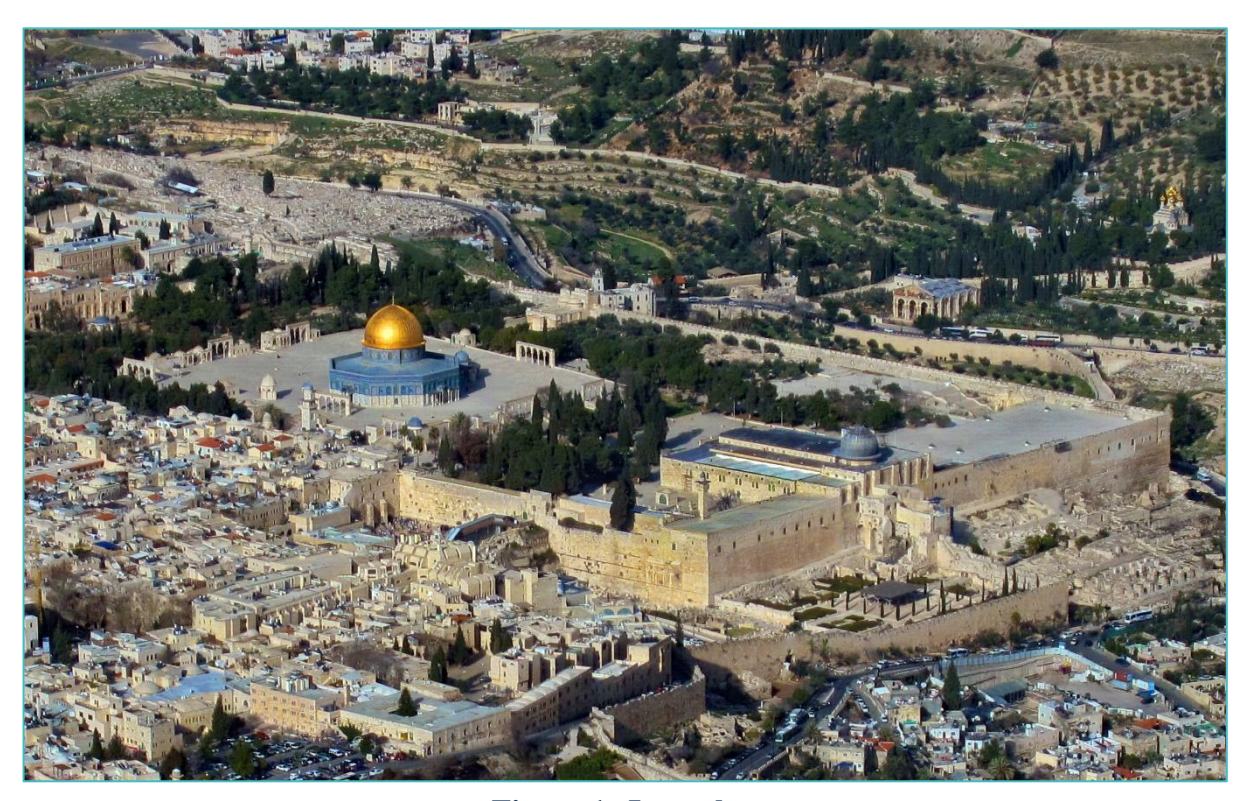
Figure 1: Jerusalem

residents - including many civilians - dying in these conflicts. Moreover, the wars result in the destruction of critical infrastructure, and reinforce capital holders' reluctance to make long-term investments, resulting in diminished living standards for those fortunate enough to escape the violence. In the 2021 United Nations Human Development Index, the average score for the Arab states was 0.71, lower than the global average of 0.73, including lower scores in each of the constituent sub-indices (health. education. material living standards), reflecting the fallout from this chronic state of intra-regional conflict. The adverse consequences extend well beyond