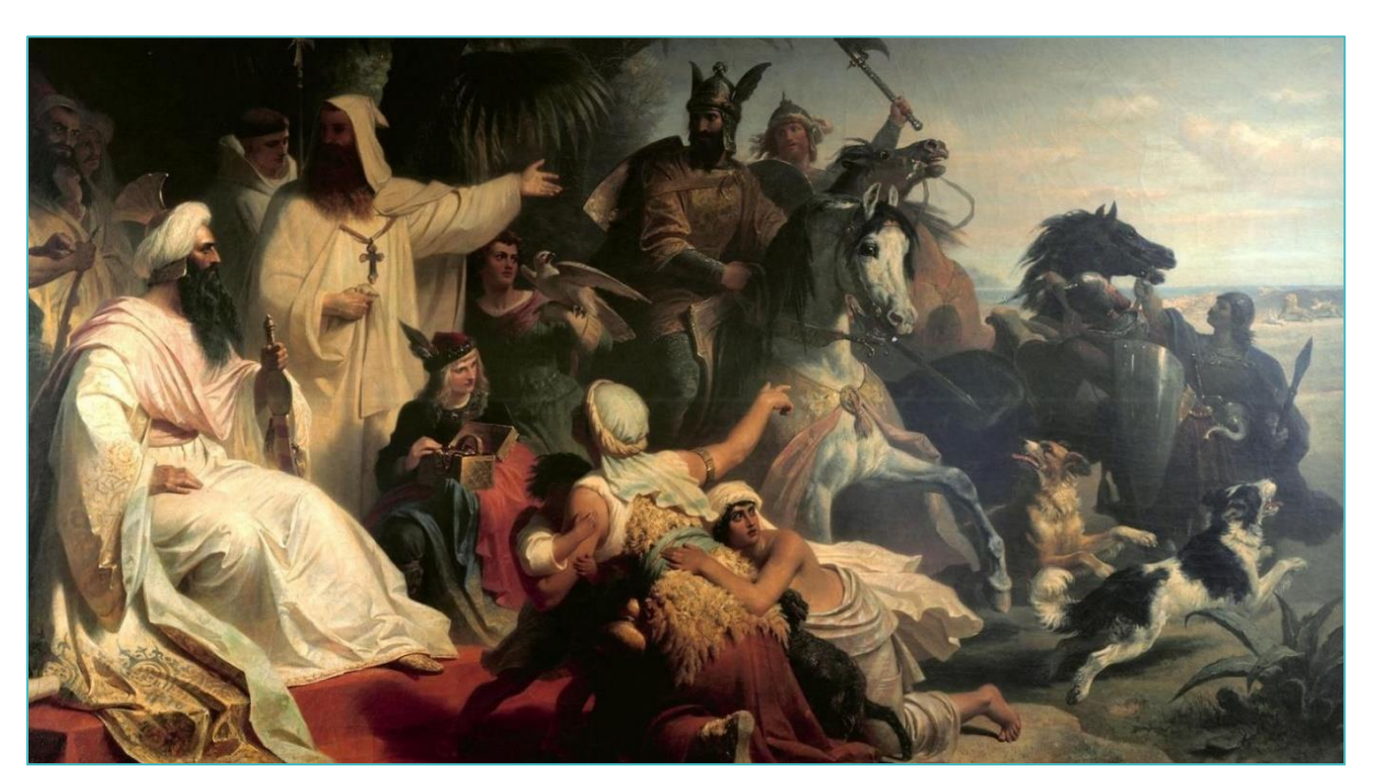
Figure 29: Harun al-Rashid at left receiving a delegation sent by Charlemagne to his court in Baghdad. 1864 painting by Julius Köckert

While this qualification is universal, it is arguably more pronounced in the MENA region, where politics tends to supersede economics, and where little progress can be made on economic differences if the underlying political conflicts are allowed to simmer or even worsen. This relates to the aforementioned point regarding the lack of autonomy that MENA economic actors have, as they are much more under the yoke of political elites than in the economies of the European Union.