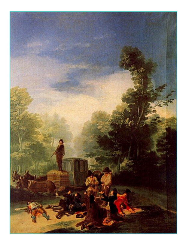
Figure 15: Asalto al coche (Attack on a Coach), by Francisco de Goya

So non-state actors can violently disrupt these kinds of issues and non-state actors can politically disrupt these kinds of interactions as you see with Jordan with anti-normalization and as you see with Houthis in the Red Sea.