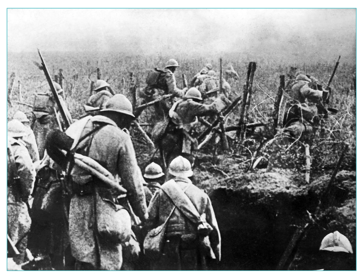
Figure 28: French soldiers during World War I

countries could facilitate infrastructure development such as railways and new ports, trade expansion, and regional integration. I believe that by recognizing and leveraging the opportunities presented by these powerful trends, the MENA region can play a proactive role in shaping its own future and driving regional development in the years ahead.