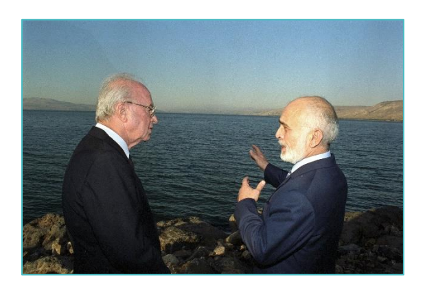
Figure 17: King Hussein and Prime Minister Yitzhak Rabin at the Lake Tiberias, in 1994

That's why I mentioned earlier, it can be used as a weapon and it can be used, there can be a threat of turning off the gas or turning off the electricity. But you have to also be a realist and ask yourself, what is the alternative? And Jordan, I can tell you it was not popular on the street in Jordan to buy gas from Israel.