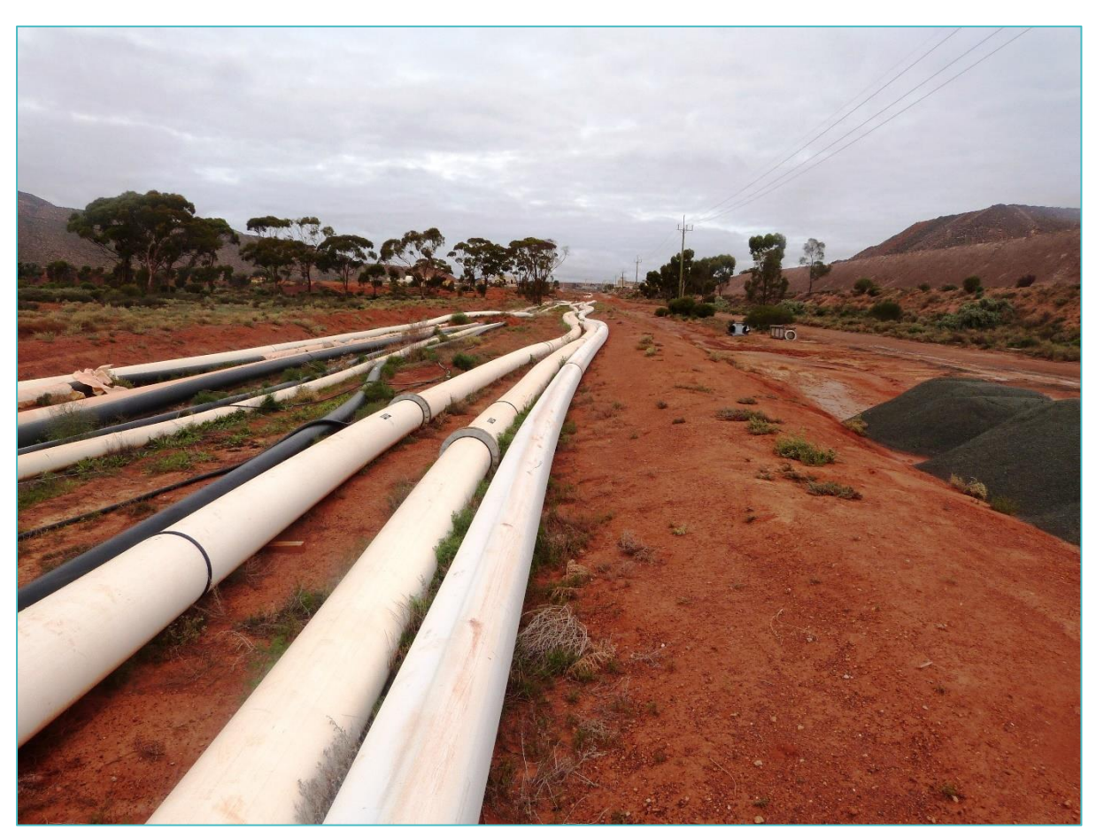
Figure 16: Energy pipelines

The problem is, don't forget, that there are political issues within political regimes in the region. A big mistrust. So if you don't solve that mistrust between governments, never ever will they be confident enough to really create that codependence. That had been the case with Iraq Saddam Hussein, Kuwait, the Ba'athist party, and Syria not trusting the Ba'athist party in Iraq. So, we have a bad history of revolutions, mingling in other people's countries, politics... Do