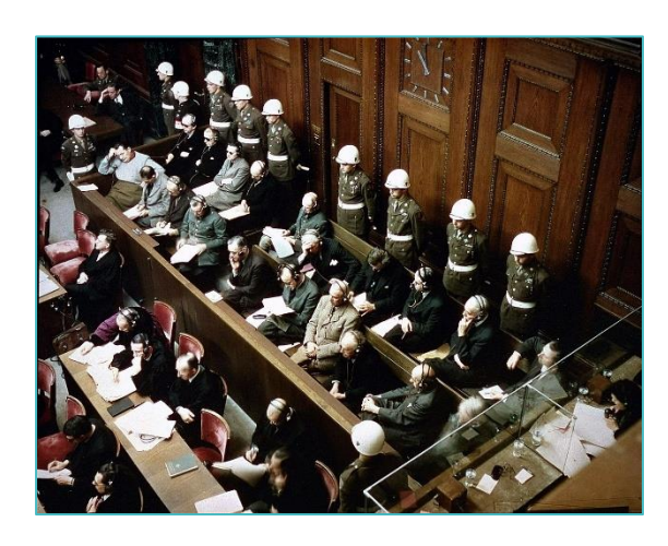
Figure 5: Defendants in the dock during the Nuremberg Trials

Take, for instance, the intricate dynamics between Egypt and Turkey. Despite political tensions arising from differing views on the Muslim Brotherhood, the economic bond between our nations not only endured but thrived. This exemplifies how economic interests often transcend political disputes, as evidenced by the recent normalization of these relations following Turkey's shift towards a more moderate stance. Such instances highlight the resilience of economic incentives in fostering reconciliation amidst diplomatic strains.