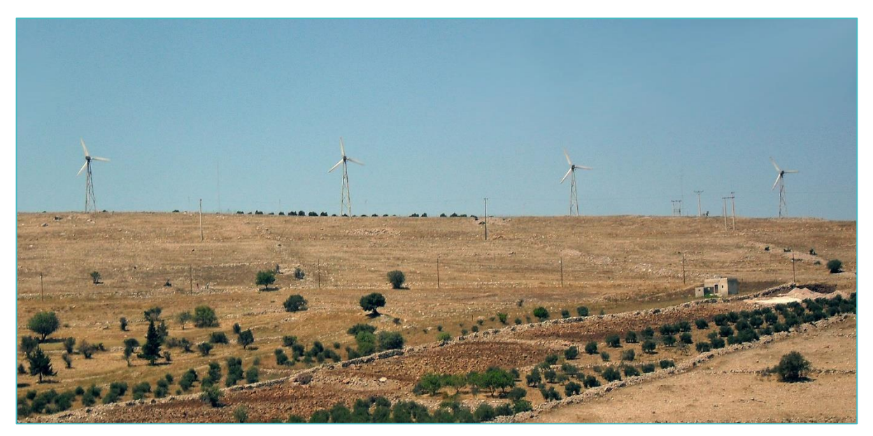
Figure 26: 320 kW Ibrahimyah (Jordan) wind power plant

went to one of these communities around Gaza that were attacked by Hamas. A guy from that Kibbutz or community was saying that it was the same Palestinian workers, working in this Kibbutz, who came on October 7 with Hamas.... He then said I will never trust a Palestinian again. So I think [the impact of this war will be long-lasting]. And, of course, the Palestinians will have their own view on the Israelis and what they're doing.