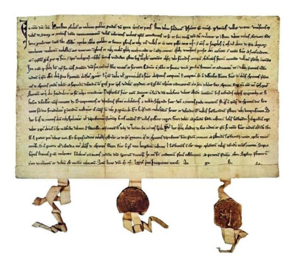
Figure 11: The Swiss Federal Charter