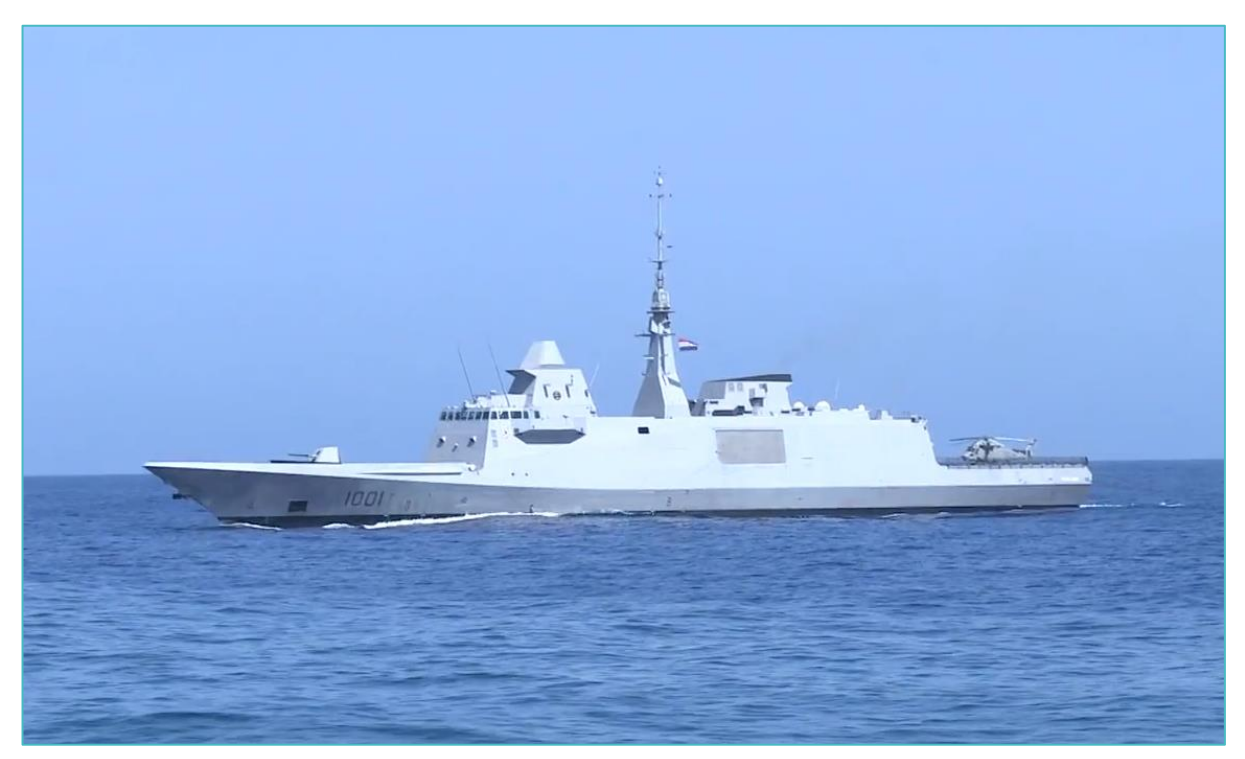
Figure 22: Egyptian warship

talking about some of the wealthiest countries in the world. We are developed countries in the region, it's not 300 years ago. I don't think the MENA is an exception. I do think a basic level of security is needed, but I don't think that trust is needed. We have different examples of countries in Africa, Asia, Europe, and the US. [In the case of China, it has limited trust