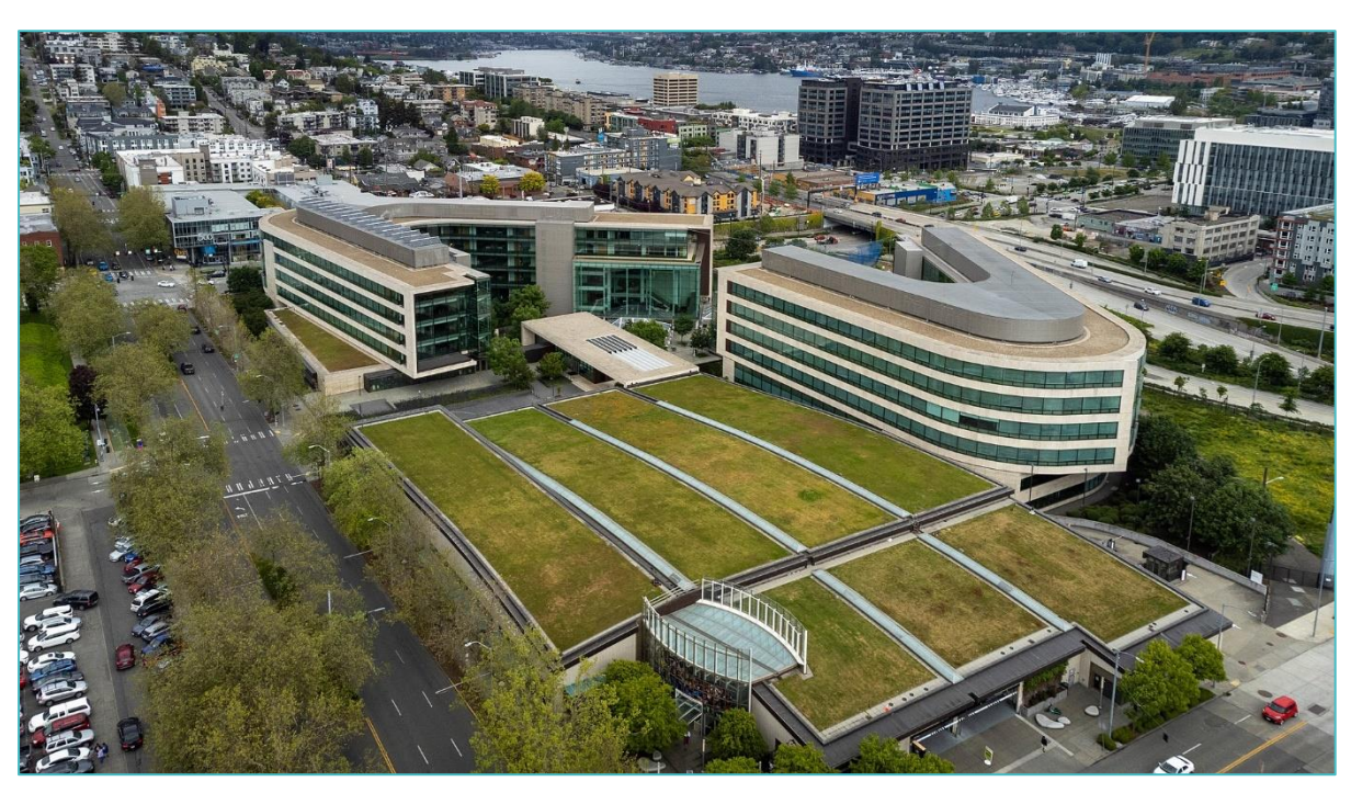
Figure 14: The Bill & Melinda Gates Foundation building

We see people like Elon Musk or Bill Gates