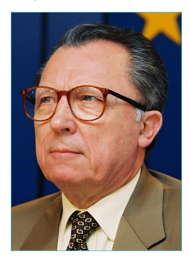
Figure 20: Portrait of Jacques Delors (1925–2023), former President of the European Commission

scenario. Unfortunately, in the MENA region, we do not have any of these conditions. Political leadership is mostly pushing for their own power projection whilst keeping in mind their highest priority of maintaining offices domestically, and the people are influenced by many factors; history, ideological beliefs, the role of the media, misinformation and so on.