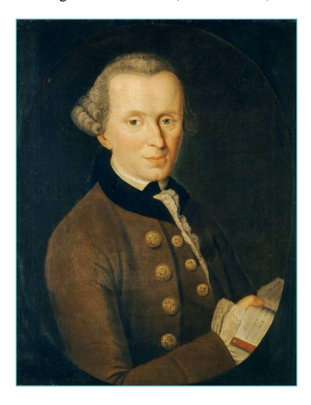
Figure 2: The Classical Liberal philosopher Immanuel Kant

championed the virtues of free trade and liberalism. economic arguing that economic interdependence serves as a catalyst for peace and prosperity among nations (Smith, 1776). Additionally, Woodrow Wilson's advocacy for selfdetermination and multilateral cooperation played a crucial role in shaping the post-World War I international order. underscoring the significance of collective security and diplomatic engagement in averting future conflicts (Wilson, 1919).