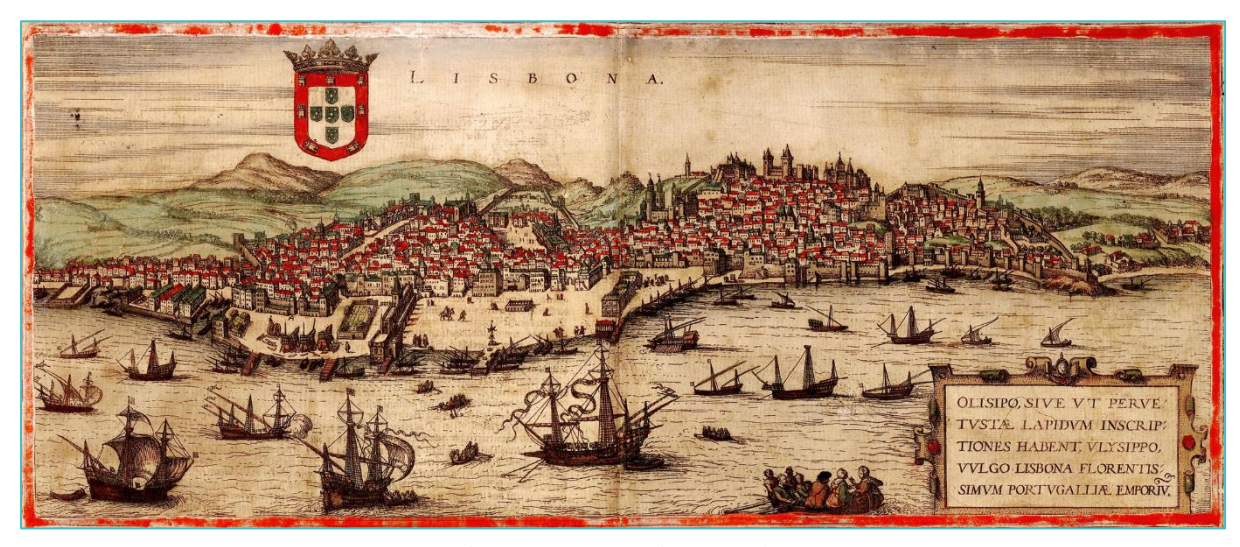
Figure 10: Medieval ships

We're not talking about Israelis and the Houthis or the Israelis and the Lebanese or the Palestinians and the Israelis. So I think these other countries have an ability to influence positively. And one way, the sort of interaction in the region, one way is by