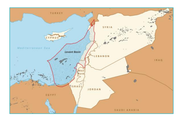
Figure 7: Boundaries of the Levant Basin

the population [Lebanese] does not like Syria, the other half likes Syria. But there is no consensus about our relationship with Syria so we cannot even sell to Syria or lay pipes to Syria. Infrastructure wise even, if we have gas, we cannot take it out of the country because of political tensions and political crises with the region. The same was with Cyprus, Cyprus had the same problem with Turkey.