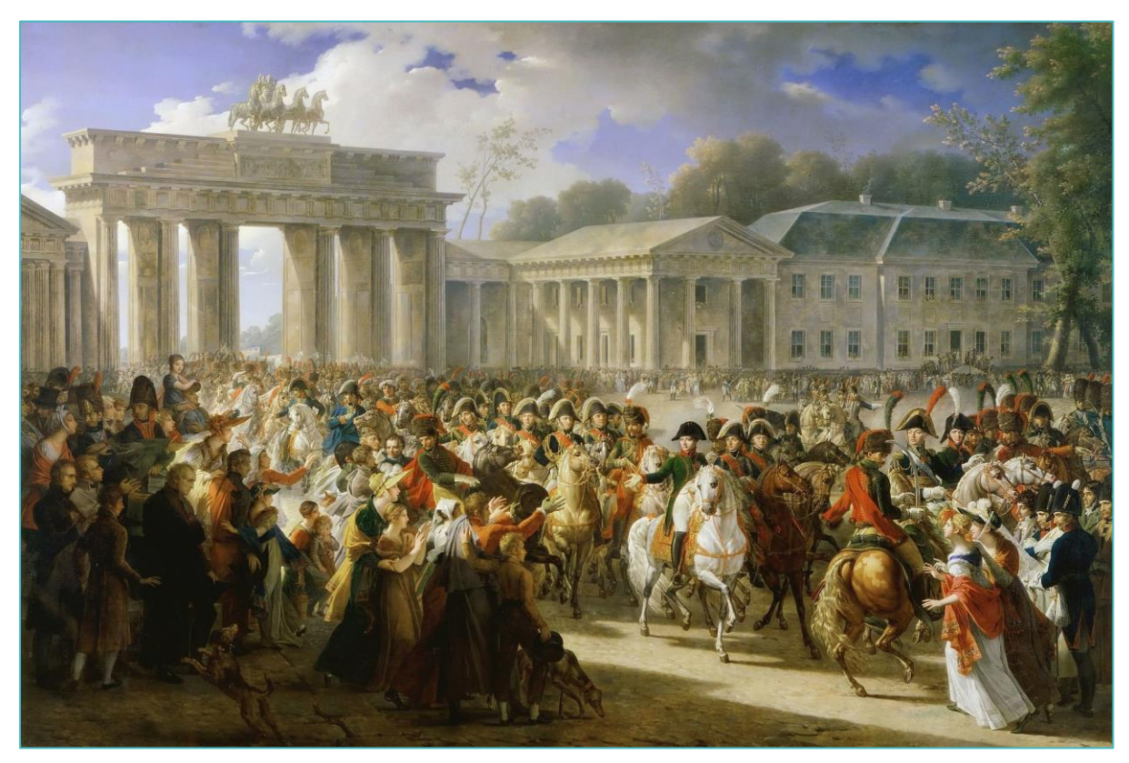
Figure 18: Entry of Napoleon into Berlin in 18060by Charles Meynier, which paved the way for the Continental Blockade against the British Empire

different levels of economic developments. You see, again, I look at the UAE, and it's clearly trying to have real diversification and a real kind of separation between the economic sphere and the political sphere. It can, as a result, work well with a country that is similar to it, and I think this is part of what we saw with the Abraham Accords because you have two economies that are working independently, and despite the political tensions they have, the economic