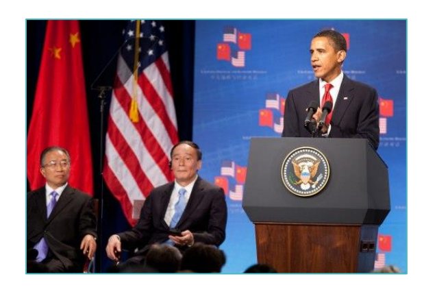
Figure 23: President Barack Obama addresses the opening session of the first U.S.—China Strategic and Economic Dialogue. Listening at left are Chinese Vice Premier Wang Qishan, center, and Chinese State Councilor Dai Bingguo, left.

world in general, is Israel stable? Could it be a stable partner? And this is before the war. Could it be a stable partner because it's so fragmented, it's so unstable as a result of the divisive policies that Netanyahu tried to instill. So that is also, I think, a feature, and it connects with trust. I think if you're certain countries in the Gulf, you want to see partners that are. And for that matter, I've heard people talk about, for example, the US role in the region. I mean, how engaged is the US in the region? And I think some folks would argue that it's less. And so then if you're a regional player, you ask yourself, well, can I trust the US to have my back? Others will say, and again, I don't want to sort of wade in on this debate right now, but others will say, no, the US is very much involved.