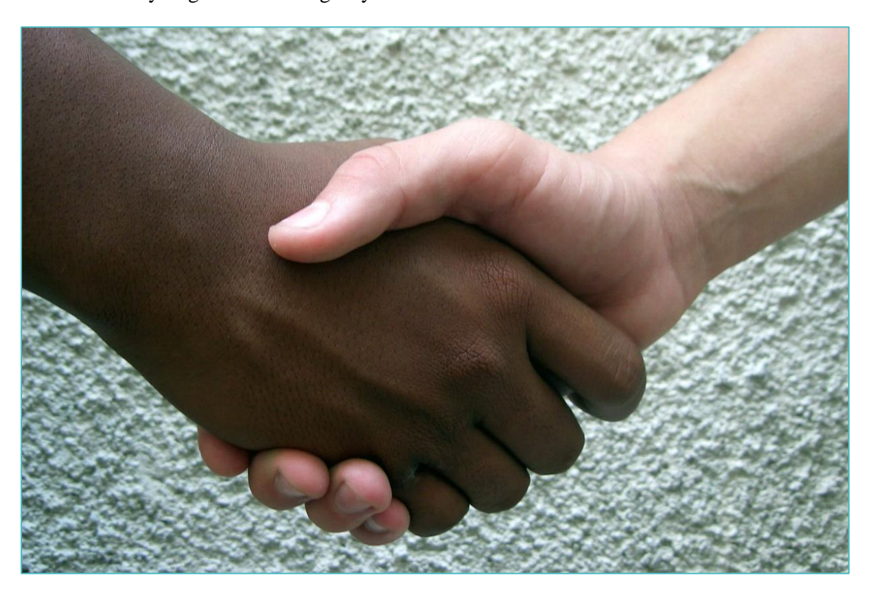
Conclusion 6 : Experts generally believe that non-state actors - especially in the current configuration in the MENA region - are a disruptive force that limits the ability to use economic integration as a way of promoting peace.

disconnect between policymakers - who make decisions about war - and ordinary people means that this affinity might not meaningfully affect decisions on violent conflict.