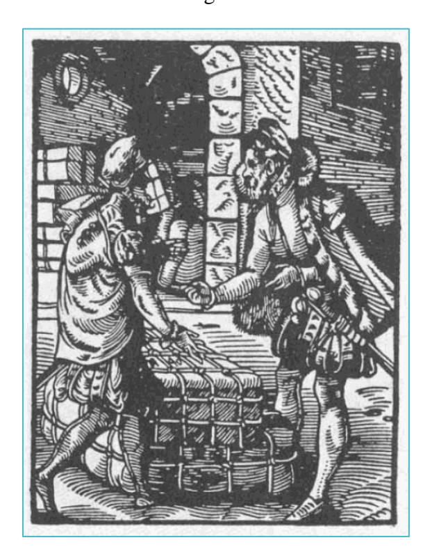
Figure 30: Two traders in 16th century Germany

The second is that the interactions should ideally be part of an attempt at tackling a shared problem. Physical trade falls under this umbrella, with the "shared problem" being that the trading partners each possess a commodity that the other side values more than them; but it can extend well beyond trade to issues such as managing common pool resources or developing mutually beneficial technologies. In this regard, it is important for the "problem" being solved to be one that both sides perceive to be external to their conflict, such as climate change.