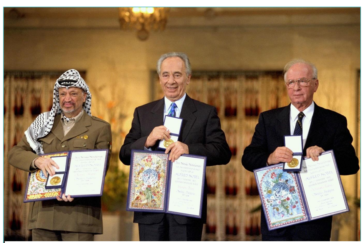
Figure 25: 1994 Nobel Peace Prize winners

Israelis and Palestinians have been doing business for years and have tried different