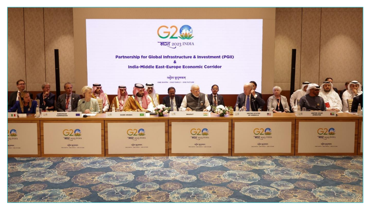
Figure 27: PM addresses at the Partnership for Global Infrastructure and Investment & India-Middle East-Europe Economics Corridor event during G20Summit, in New Delhi on September 09, 2023

mercy, and cooperation as guiding tenets, nations in the region can pave the way for a brighter future characterized by trust, mutual respect, and shared prosperity. It's of the utmost importance to reassess prevailing interpretations of religion and to prioritize the collective well-being of all people, transcending notions of supremacy and division. While impediments may have occurred and are presently occurring, due to