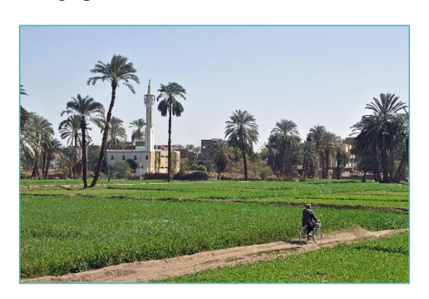
Figure 19: Farmland in the Egyptian countryside

tumultuous past marked by hostilities, both Israel and Egypt witnessed periods of economic prosperity following a reduction in military expenditures and border tensions. The aftermath of conflicts saw a surge in international investments that catalyzed economic growth in Egypt, particularly evident in collaborative agricultural ventures with Israel, yielding remarkable advancements, notably in orange production.