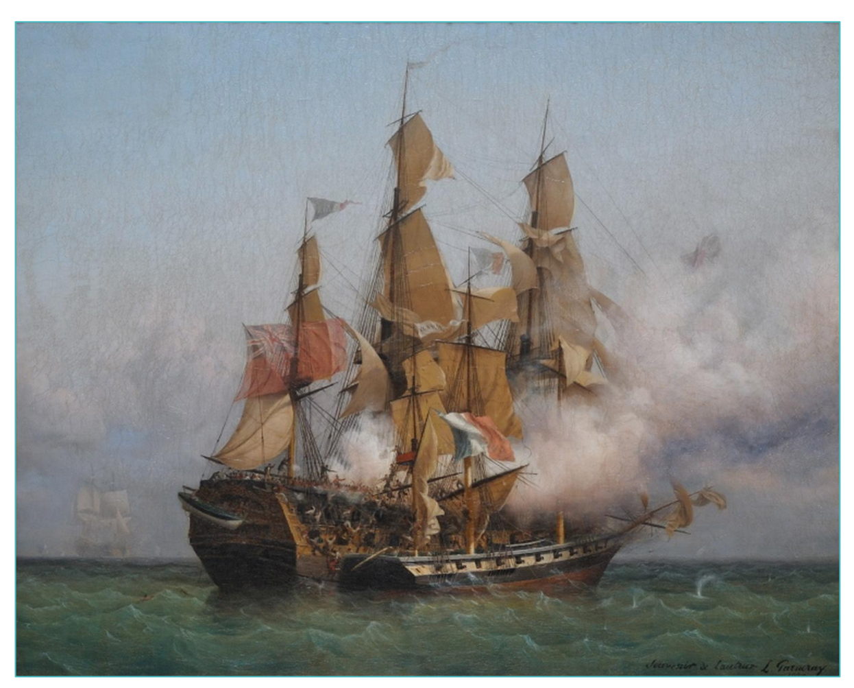
Figure 12: East Indiaman Kent (left) battling Confiance, a privateer commanded by French corsair Robert Surcouf in October 1800, as depicted in a painting by Ambroise Louis Garneray

Cinzia Bianco (Participant 4): Definitely. I would say that the fact that there are powerful non-state actors in many parts of the region complicates the picture because