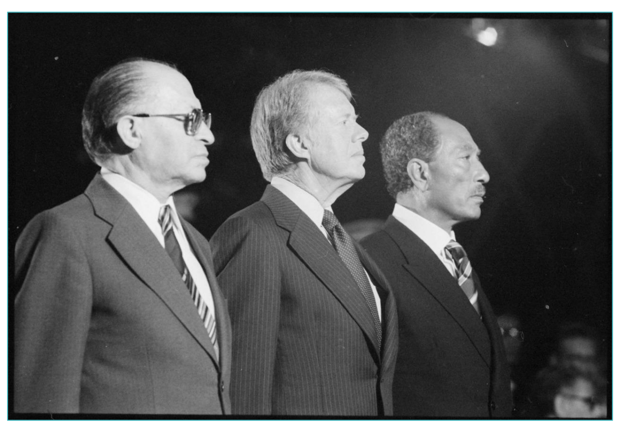
Figure 6: The Camp David Accords, 1978

Cinzia Bianco (Participant 4): I do think that this is plausible. However, I want to highlight two cases that go in the opposite direction. [Two examples of economic dependence being weaponized due to political conflicts]. It is important to say that when there are mutually strategic