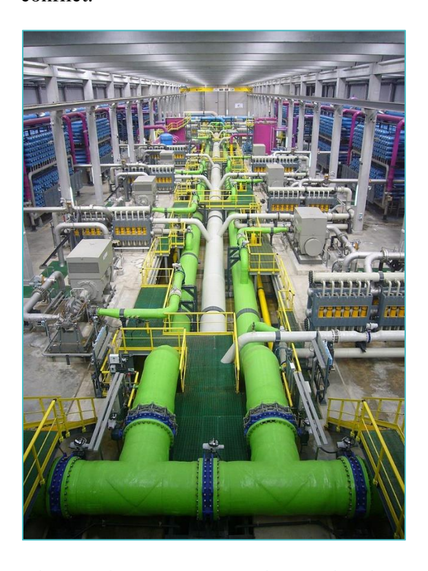
Figure 24: Reverse osmosis desalination plant

Hesham Beshara (Participant 1): In contemplating the economic relations between Palestinians and Israelis, I believe it's imperative to acknowledge their historical complexity, punctuated by the past and, of course, the current ongoing conflict.